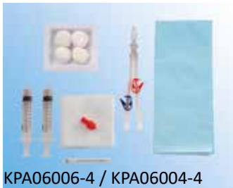
KPA06006-4 / KPA06004-4

Plastic scissor clamp for easy clamping of tubes of up to 7 mm diameter.